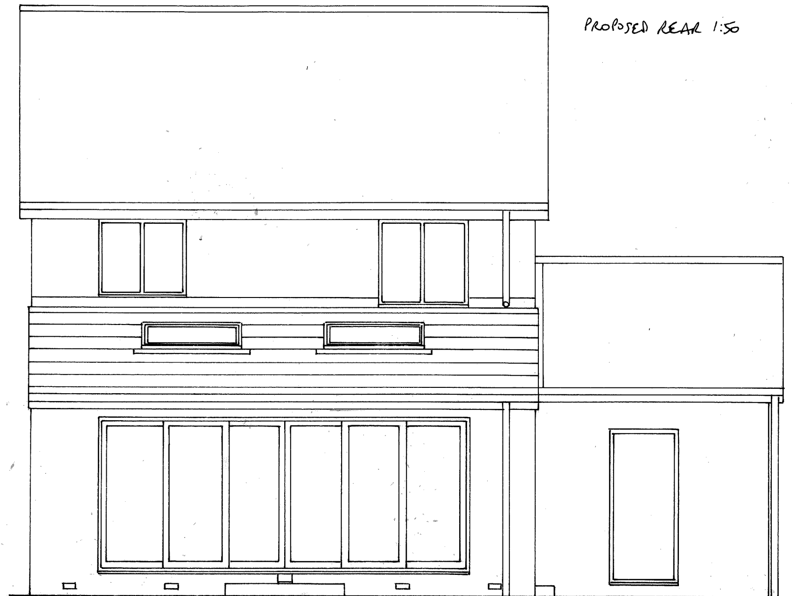
PROPOSED REAR 1:50

ROOF TILE, WHITE UPVC RW. GOODS/FASCIA/FRAMES, FACING BRICK, ETC. TO MATCH EXISTING AS CLOSELY AS POSSIBLE.